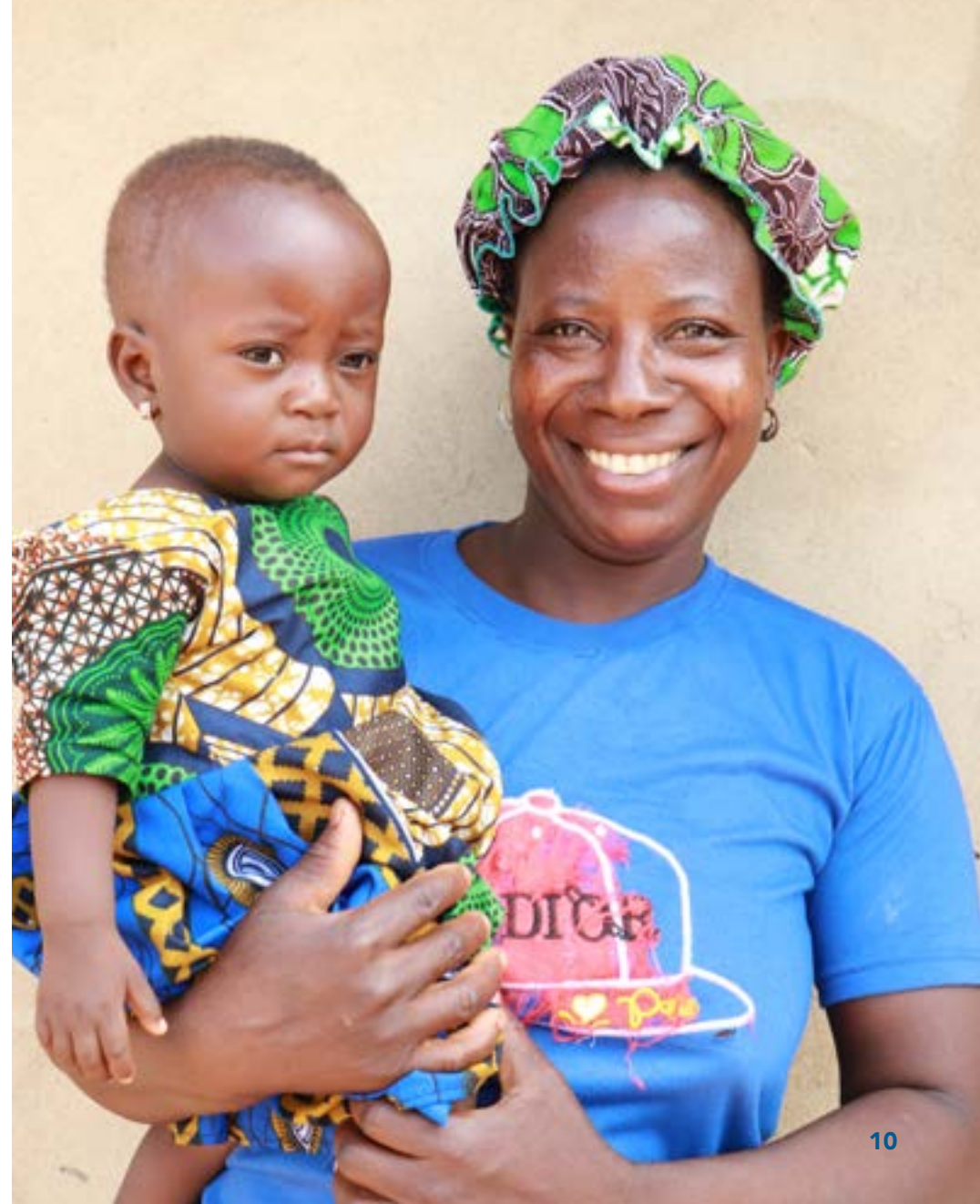
Mom and baby in front of their home in the Binah district, Togo.