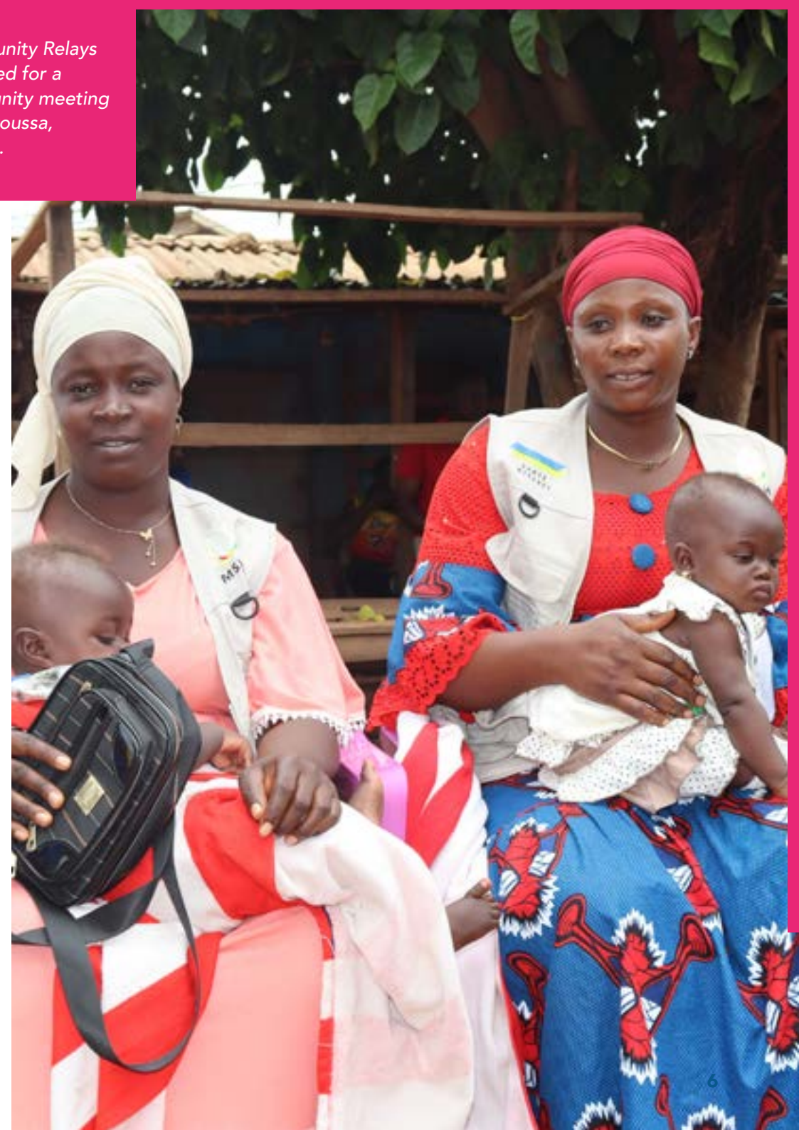
Community Relays gathered for a community meeting in Kouroussa, Guinea.

Community Townhall Meetings: In April, IH held community townhall-style meetings for the first time, creating a space for community members to ask questions and provide feedback about the program. Five community townhall meetings were held in each of the five IH-support communities with a total of 161 participants. Community members shared their feedback on the Integrated Primary Care Program and communicated their happiness with the free health care and the lifesaving referral services IH provides to patients including pregnant women with complications. Community members also noted that utilization of health centers particularly for children has increased. IH is reviewing some recommendations made during these meetings which include the need to recruit Community Relays (CRs) in remote communities that currently do not have one (see challenge