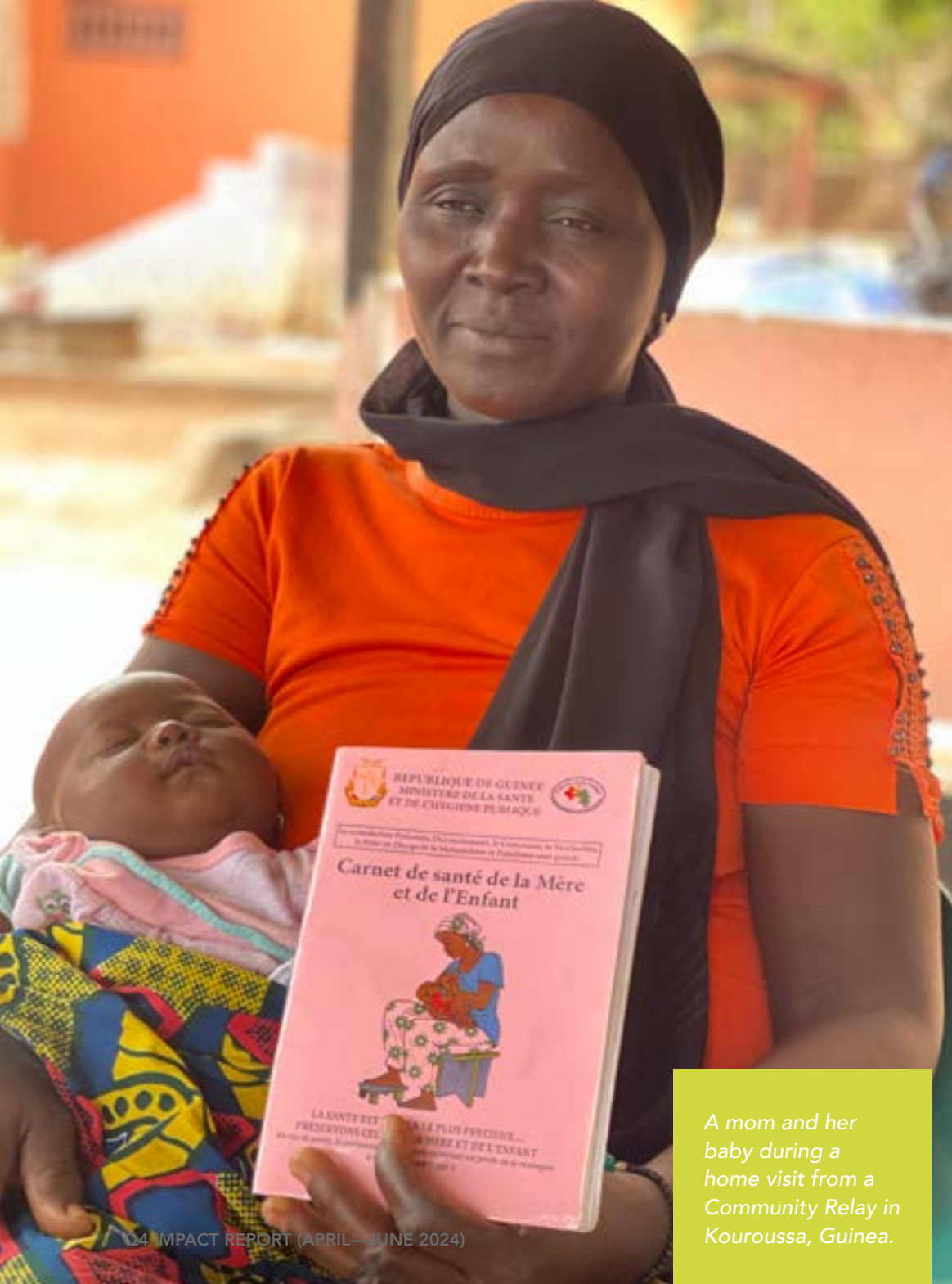
A mom and her baby during a home visit from a Community Relay in Kouroussa, Guinea.

section below), and to consider constructing a pavilion at one of the health centers, the Kansereya health center, to keep patients cool in the waiting area.